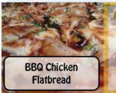
BBQ Chicken Flatbread