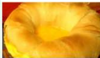
Sausage & Egg Croissant

What's this? A breakfast sandwich, served for LUNCH! We take fresh sausage, egg, and cheese and put it all on a flaky croissant to eat like a sandwich. Enjoy it with Baby Cakes—they're like mini hash-browns for breakfast.