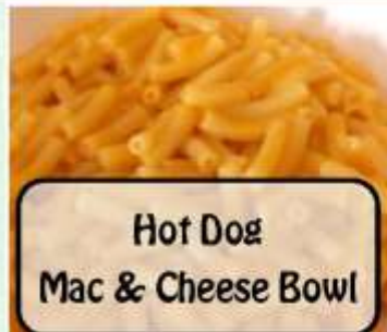
Hot Dog Mac & Cheese Bowl

This month try our delicious dish with sliced hot dogs mixed in or on the side!